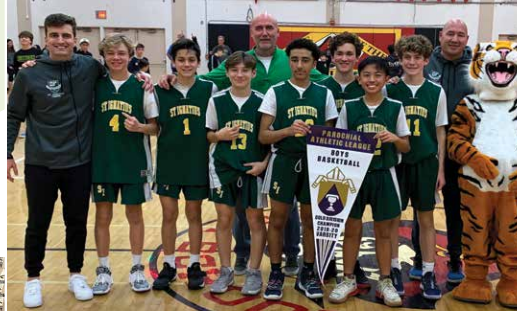
2019–2020 Champions (Varsity)